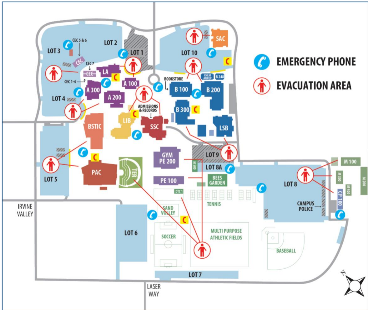
Map 2: Irvine Valley College Evacuation and Assembly Areas Map